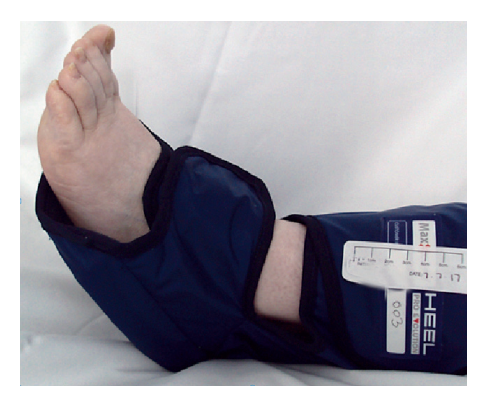
Figure 1. Example of Maxxcare Pro Evolution Heel boot offloading the left foot