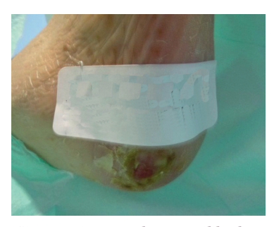
Figure 5. Day 14: the wound had decreased to less than 0.5 \, \mathrm{cm}^2