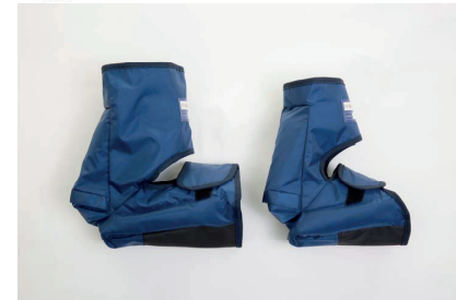
Figure 2. Size guide

Implementing an effective heel protection programme involves adopting a multi-faceted approach which includes performing a risk assessment and undertaking a comprehensive examination of skin integrity in those patients deemed at high risk of pressure damage (NICE, 2014). The strength of evidence suggests that the ideal pressure-redistributing techniques for offloading the heels should reduce pressure, friction and shear; separate and protect the ankles; maintain heel suspension; and prevent foot drop (Black, 2004).